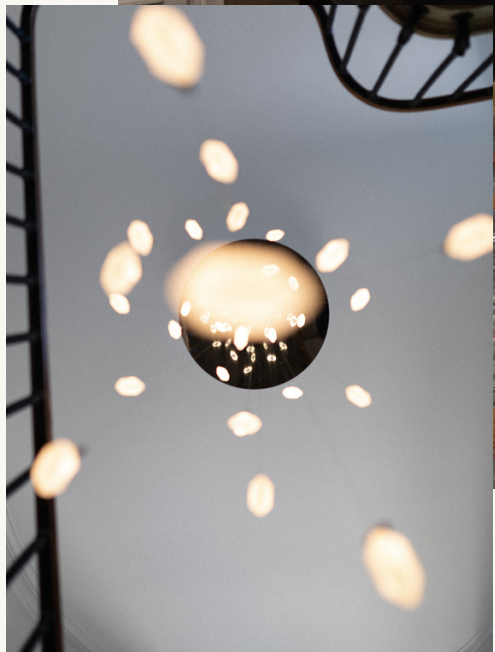
Indoor living areas