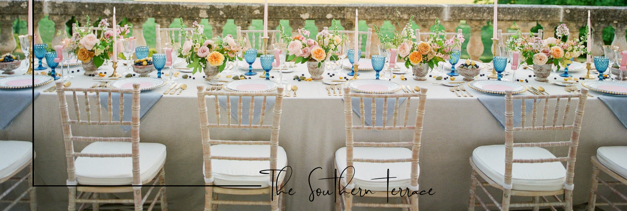
The Southern Terrace