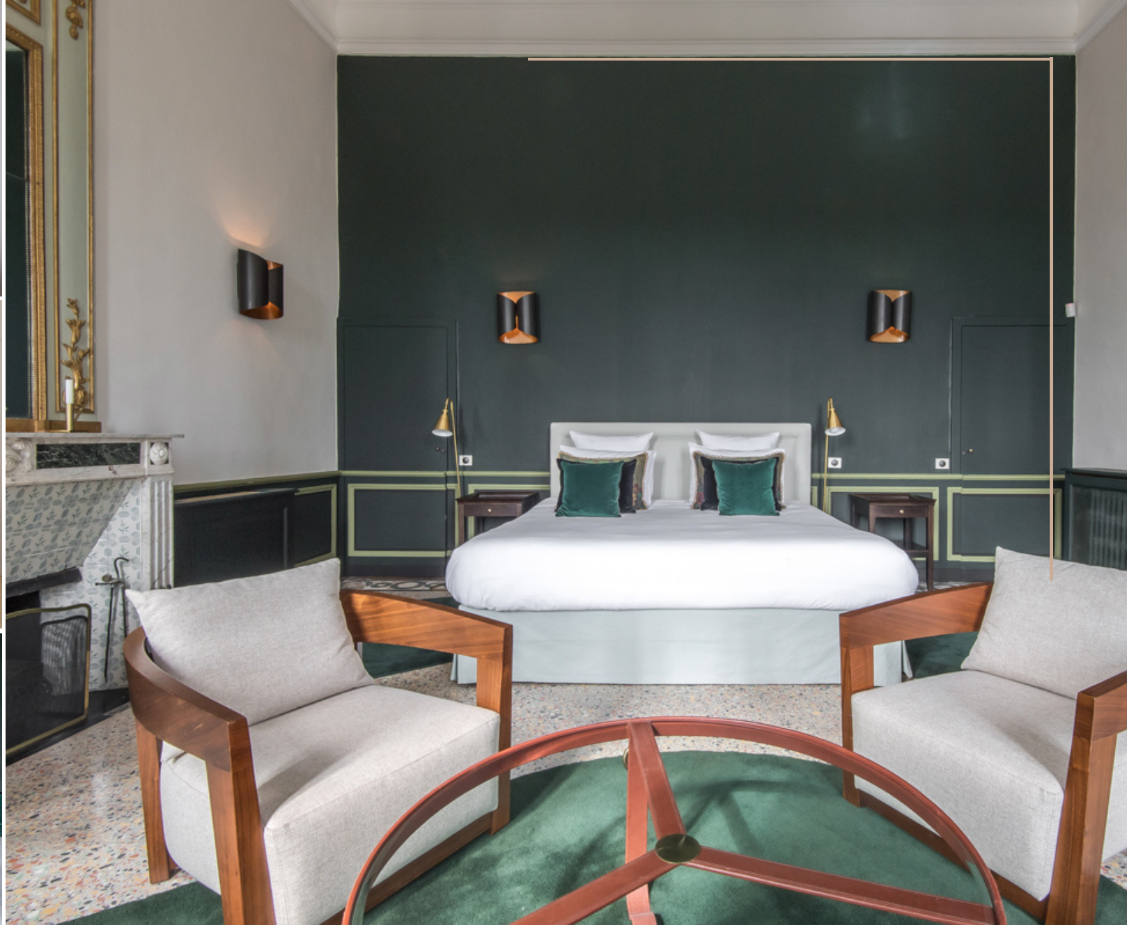
Accommodation on-site The Bride and Groom suite