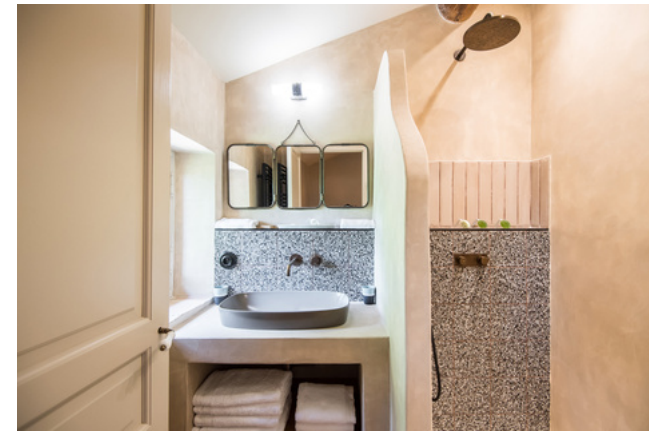
The pavillon du Levant