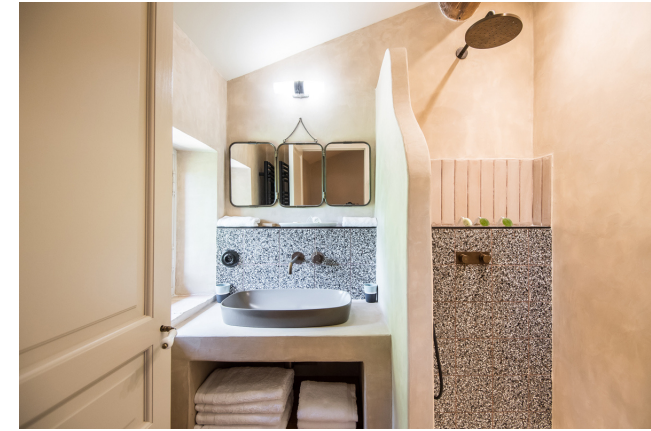
The Pavillon du Levant